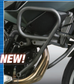
XAG™ ADVENTURE GUARDS

When a bracket kit is included, we call this windscreen a Vstream+.