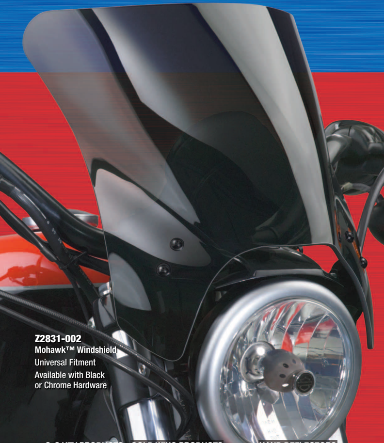
Z2831-002 Mohawk™ Windshield Universal Fitment Available with Black or Chrome Hardware