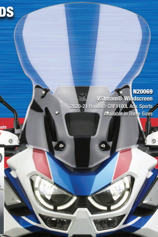
N20069 VStream® Windscreen 2020-21 Honda® CRF1100L Adv. Sports Available in Three Sizes

National Cycle 3-Year Warranty Our exclusive 3-Year Warranty covers all polycarbonate windscreens and windshields against breakage.